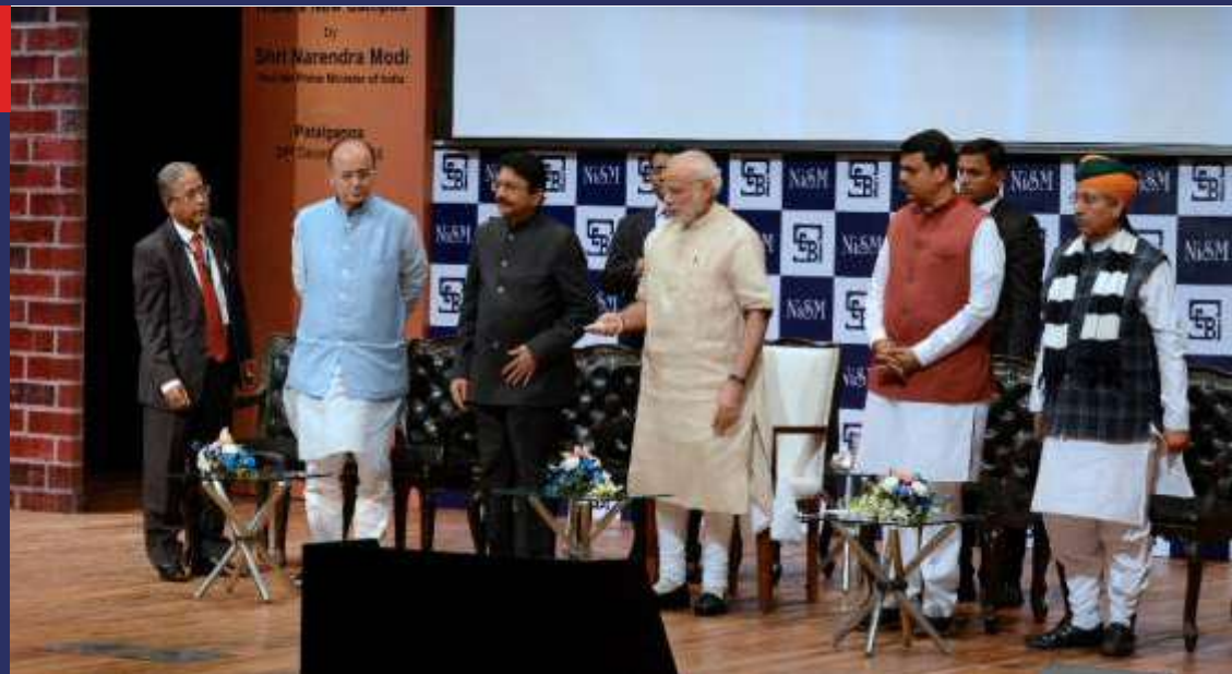
Inauguration of NISM's state-of-the-art Campus at Patalganga by Shri. Narendra Modi , Hon'ble Prime Minister of India.