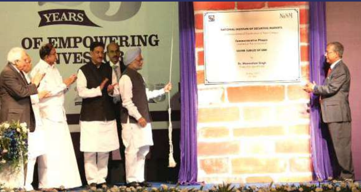
Commemorative plaque of commencement of construction of NISM campus by Dr. Manmohan Singh , Former Prime Minister of India.