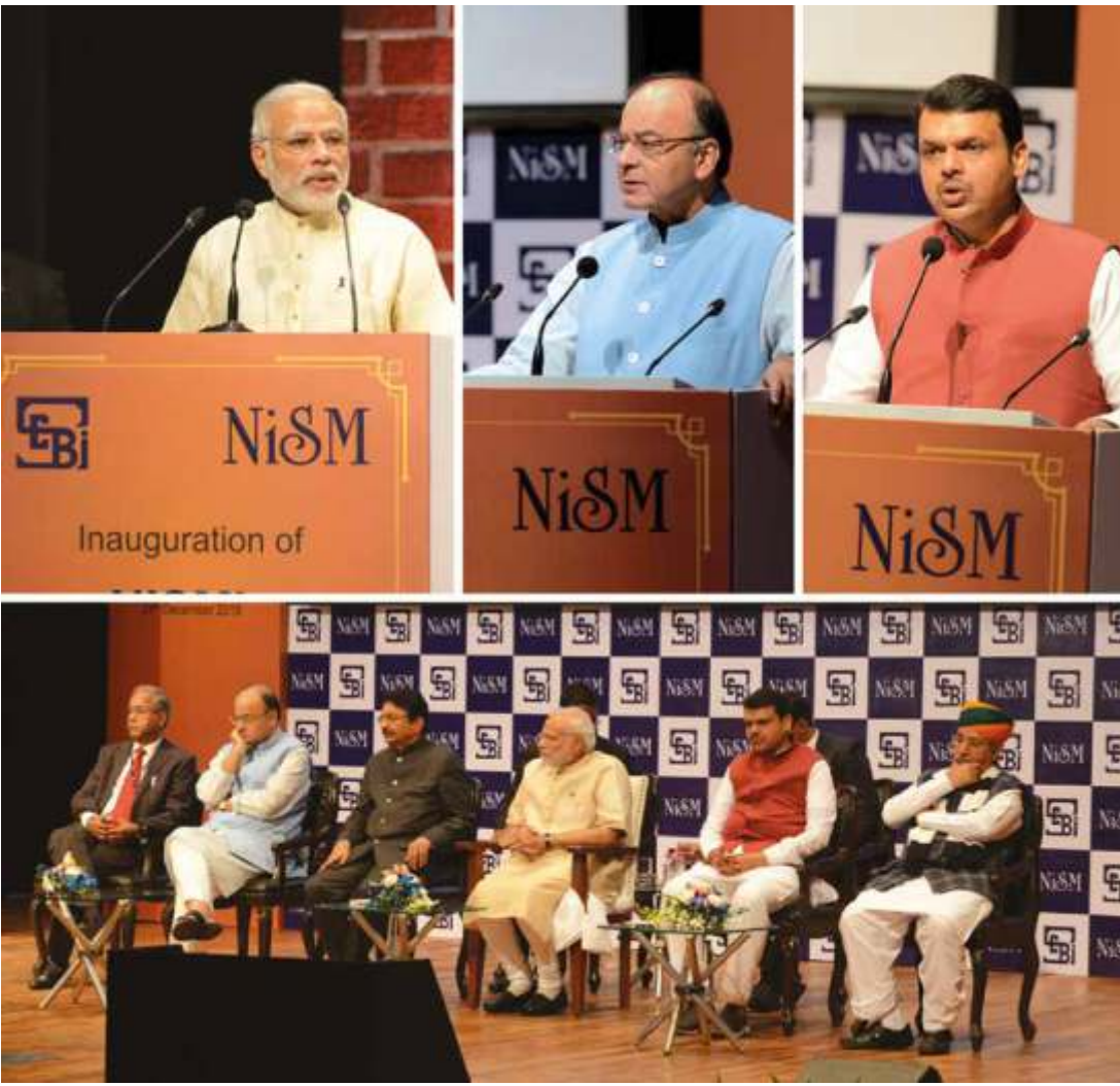
Inauguration of NISM's State-of-the-art Campus at Patalganga by Shri Narendra Modi , the hon'ble Prime Minister of India. on 24th December 2016.